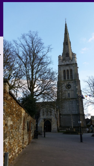
Ss Peter and Paul, Kettering