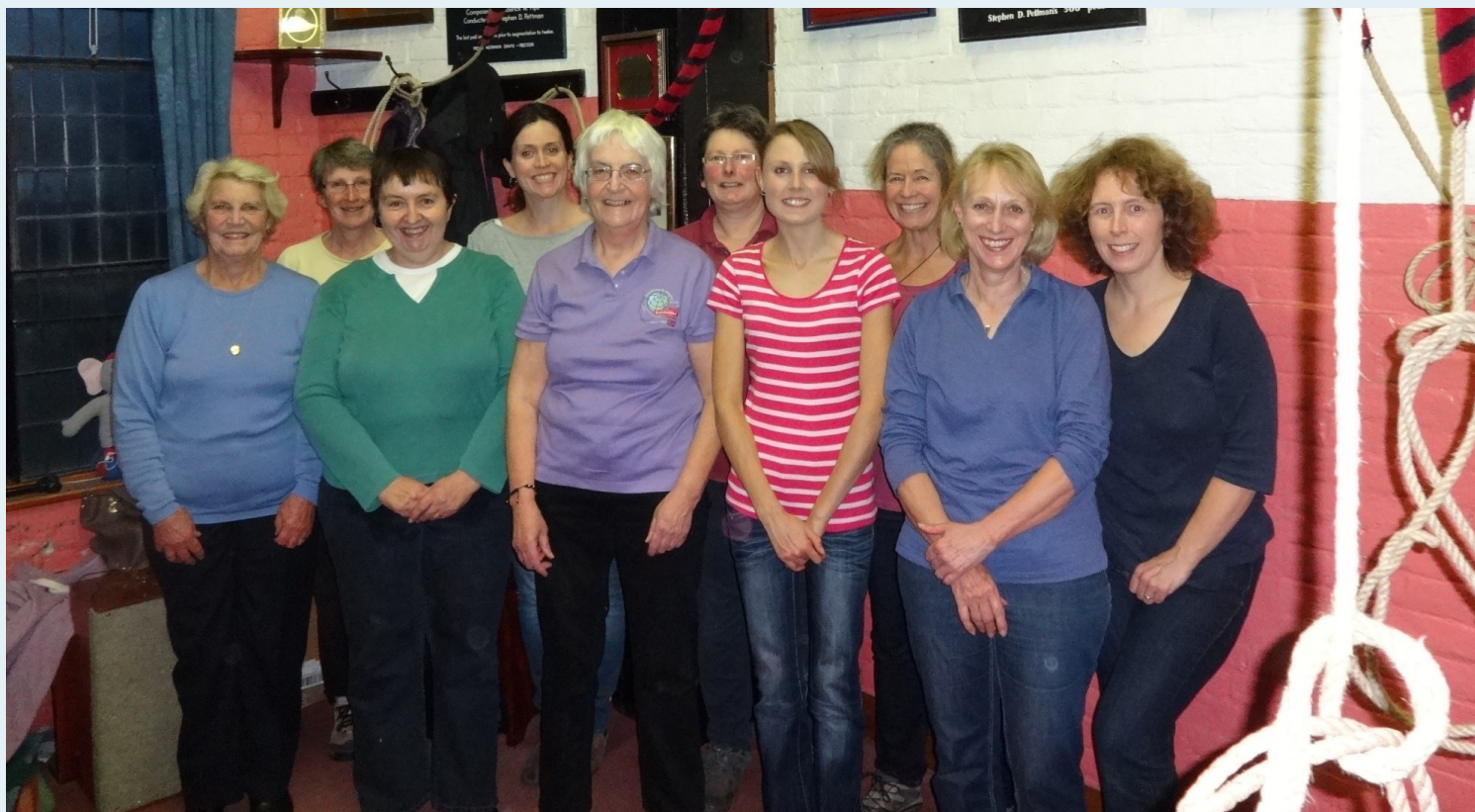
The Suffolk ladies band who rang a peal of Yorkshire Surprise Royal at Grundisburgh for peal weekend