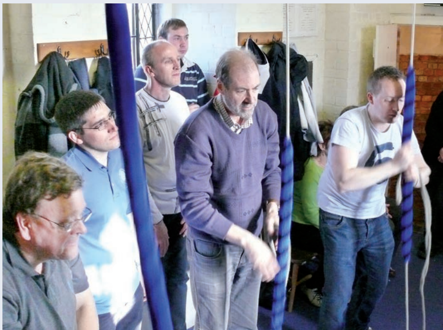
■ General ringing at All Saints', Basingstoke