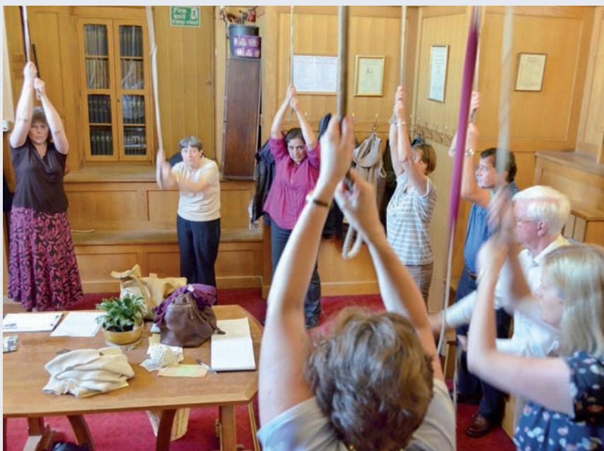
■ Ringing at St Martin-in-the-Fields