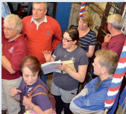
■ General ringing at Narborough