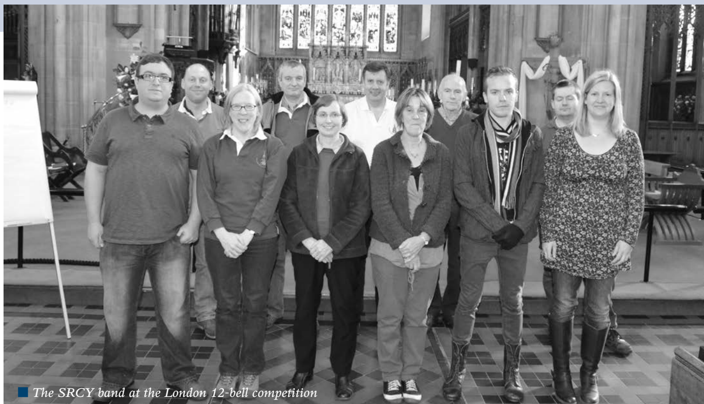
■ The SRCY band at the London 12-bell competition