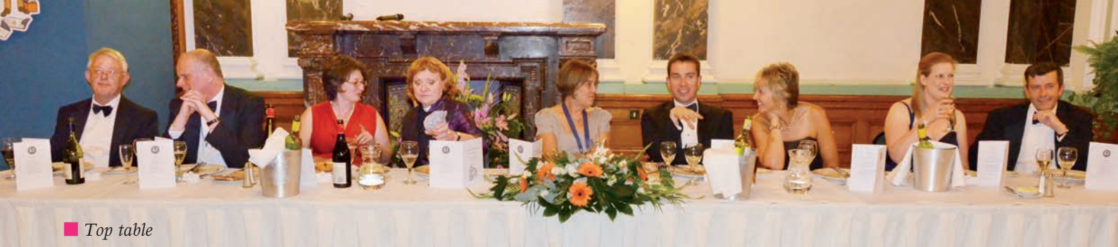
■ Top table