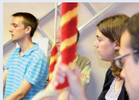
■ General ringing