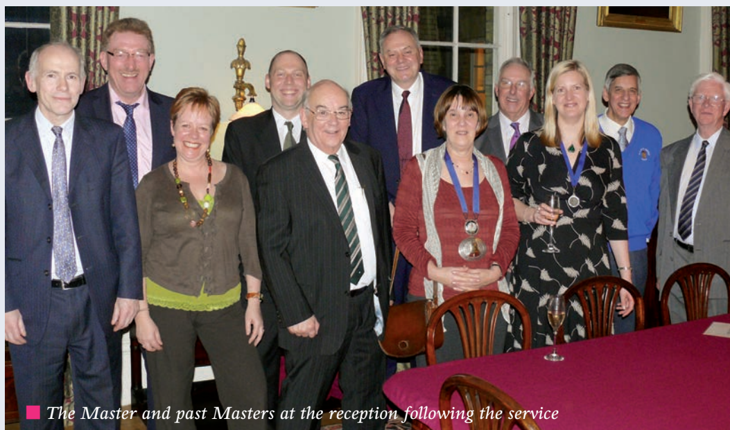
■ The Master and past Masters at the reception following the service