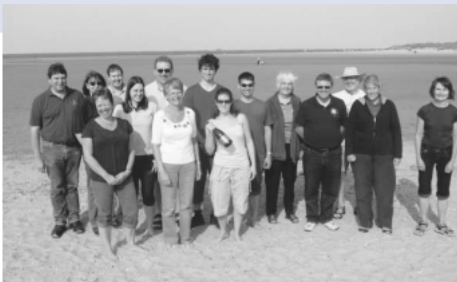
ESRCY members on the beach at Holkham

It is strange to consider that only a year ago the new initiative of ESRCY practices was having its first tentative outing at St Peter Mancroft in Norwich. The group has flourished over the intervening 12 months, holding bi-monthly practices which have, without fail, been well-attended.