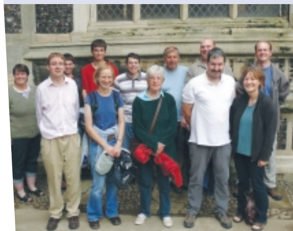
St Peter Mancroft team