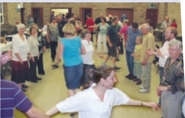
SRCY members and friends get dancing