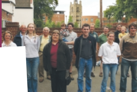
SRCY Midlands region team

Now it's time for the Cumberlands to go home. Didn't they have fun?