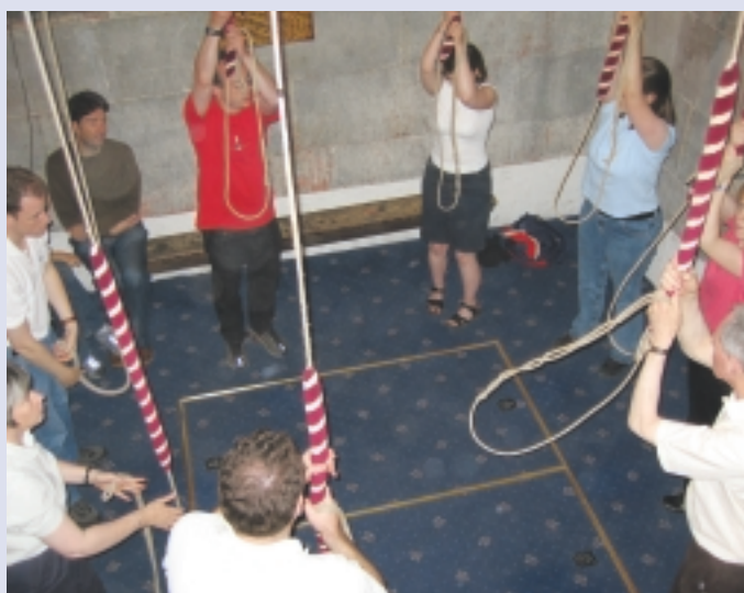
Spitalfields Open Day