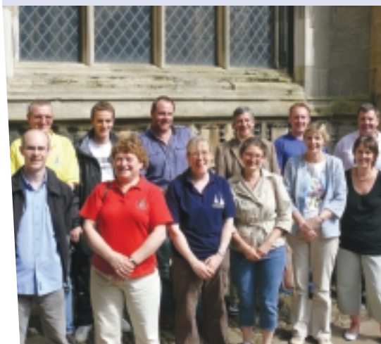
St Martin-in-the-Fields team