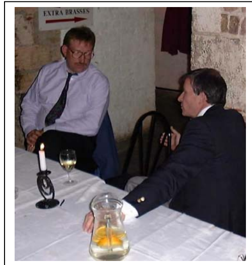
‘I can ring slower than you’

A good time was had by all. Our thanks go to the organisers for all their hard work and we look forward to enjoying many more events of this nature.